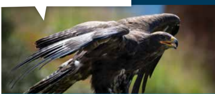
STEPPI STEPPE EAGLE ( Aquila nipalensis ); Length: 62 – 74 cm / Wingspan: 165 – 200 cm / Weight: 2,400 – 3,800 g