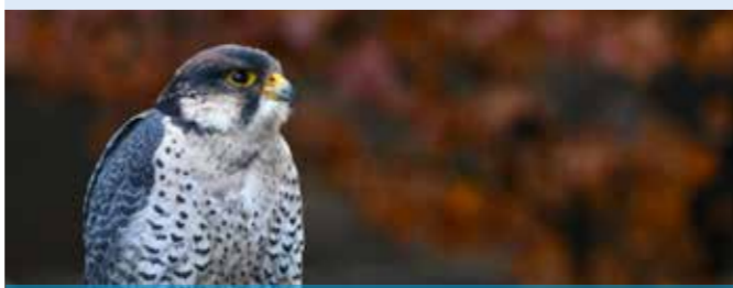
KAYA LANNER FALCON ( Falco Biarmicus ) Length: 43 – 50 cm / Wingspan: 95 – 105 cm / Weight: 500 – 900 g