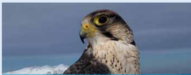
DIANA LANNER FALCON ( Falco Biarmicus ) Length: 43 – 50 cm / Wingspan: 95 – 105 cm / Weight: 500 – 900 g