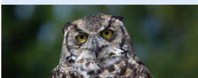
BILLI & VIRGINIA VIRGINIA EAGLE OWLS ( Bubo virginianus ) Length: 46 – 63 cm / Wingspan: 91 – 151 cm / Weight: 750 – 1,300 g