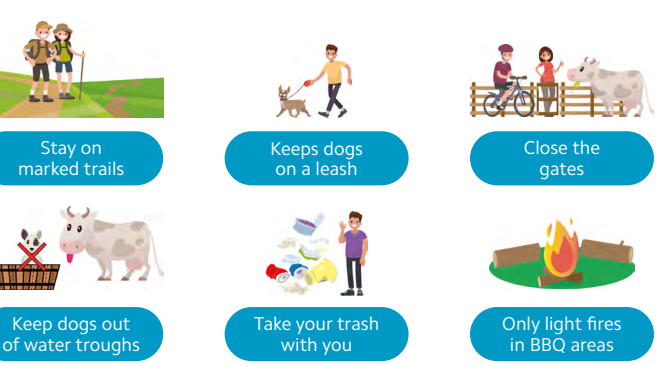
Respect the mountains. Thank you for your understanding!